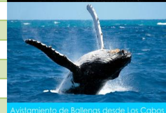
Avistamiento de Ballenas desde Los Cabos

Enjoy this Newsletter? Forward to a Friend or Share on Your Social Networks